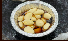
Garlic with Sesame Oil