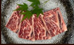
Beef Rib with Bone