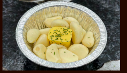
Garlic with Butter