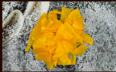
Takuan (pickled radish)