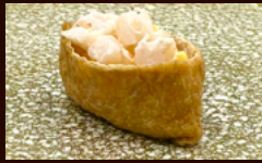
Prawn Mayo Inari