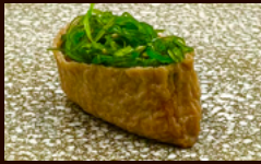
Seaweed Salad Inari