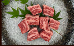
Angus Beef Rib Finger