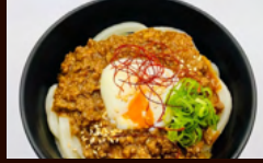
Spicy Beef Maze Udon