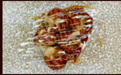
Takoyaki (octopus ball)