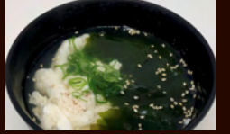
Seaweed & Egg Soup