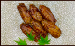
Nagoya Style Tebasaki