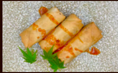
Deep Fried Spring Roll