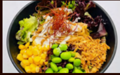
Teriyaki Chicken Salad