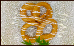
Fried Onion Rings