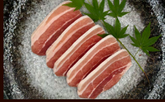
Free Range Pork Rib