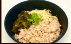
Salmon Flake Rice