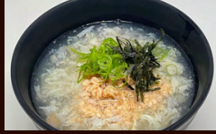
Egg and Salmon Kuppia