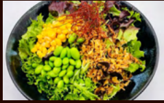
Mixed Green Salad