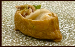
Stamina Scallop Inari